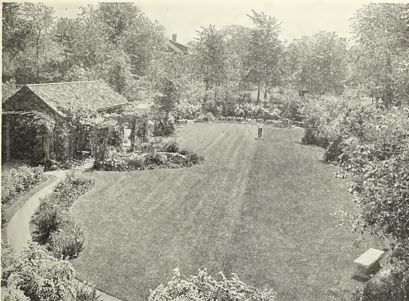
A charming suburban garden in Rochester, N.Y., that shows correct landscape planning. The outer border of flowering shrubs furnishes color from early spring to time of autumn frosts. The marginal beds are gay with Iris, Peonies, Sweet William, Poppies, Chrysanthemums, and other perennials that prolong the blooming season.